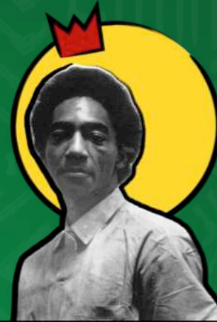
RUCHELL "CINQUE" MAGEE

REVOLUTIONARY, POLITICAL PRISONER, AND PRISON ABOLITIONIST