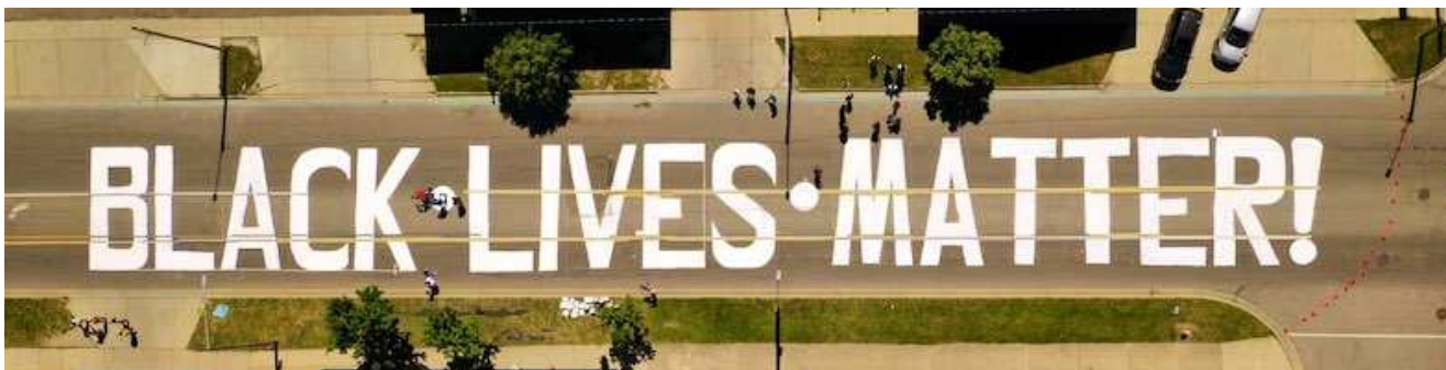
Black Lives Matter street mural on Martin Luther King Boulevard in Flint, Michigan

In 2020, organizers from the BLM Flint chapter spearheaded the creation of a street mural on Martin Luther King Boulevard, initially supported by the Mayor's office. However, days before the 2023 Juneteenth Festival, where supplies and volunteers were ready to repaint the mural, the City reversed course and stopped restoration efforts, citing state-level traffic safety concerns. Fortunately, a Michigan Department of Transportation (MDOT) spokesperson declared the road locally owned and operated and therefore did not require a MDOT permit and such decisions were entirely up to the city.